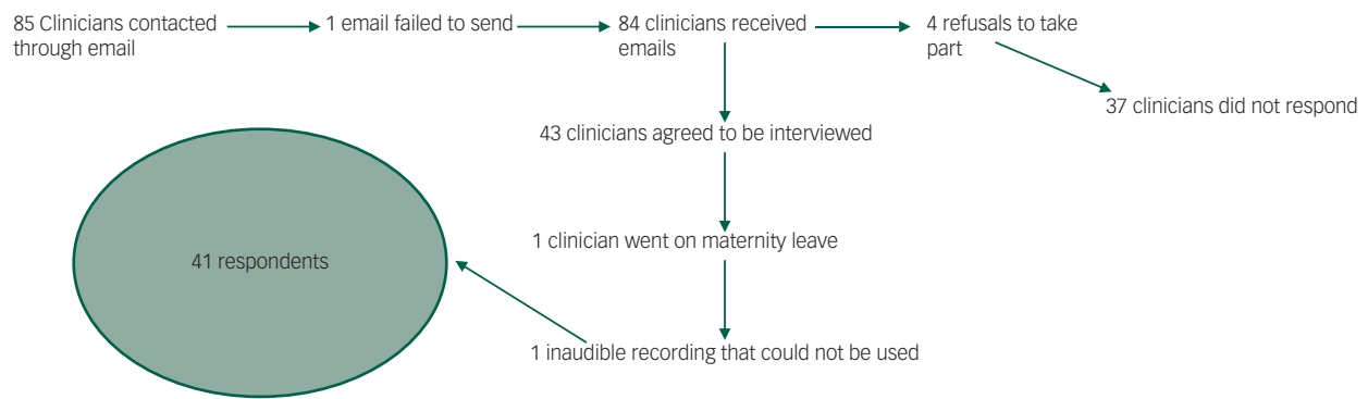
Fig. 1 Attrition chart: pathway to respondents.

be considered and treated with equal importance. However, in interviews across all mental health subspecialties, doctors appeared to draw upon knowledge and experience to name specific